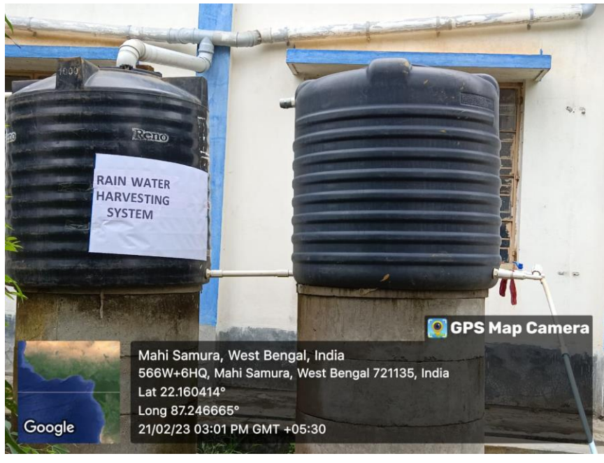
Figure 6: Geo-tagged photographs of roof-top rainwater harvesting system installed at Government General Degree College, Keshiary purposed for watering of the college garden and aquaculture unit