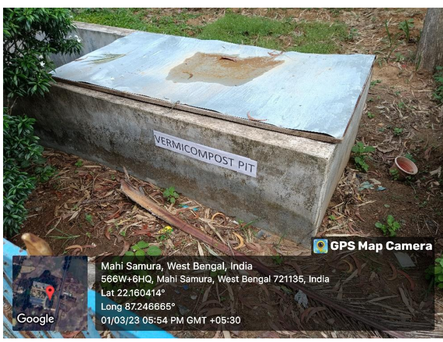
Figure 2: Geo-tagged photographs of a construction pit within the college campus repurposed for vermicomposting for processing biodegradable wastes