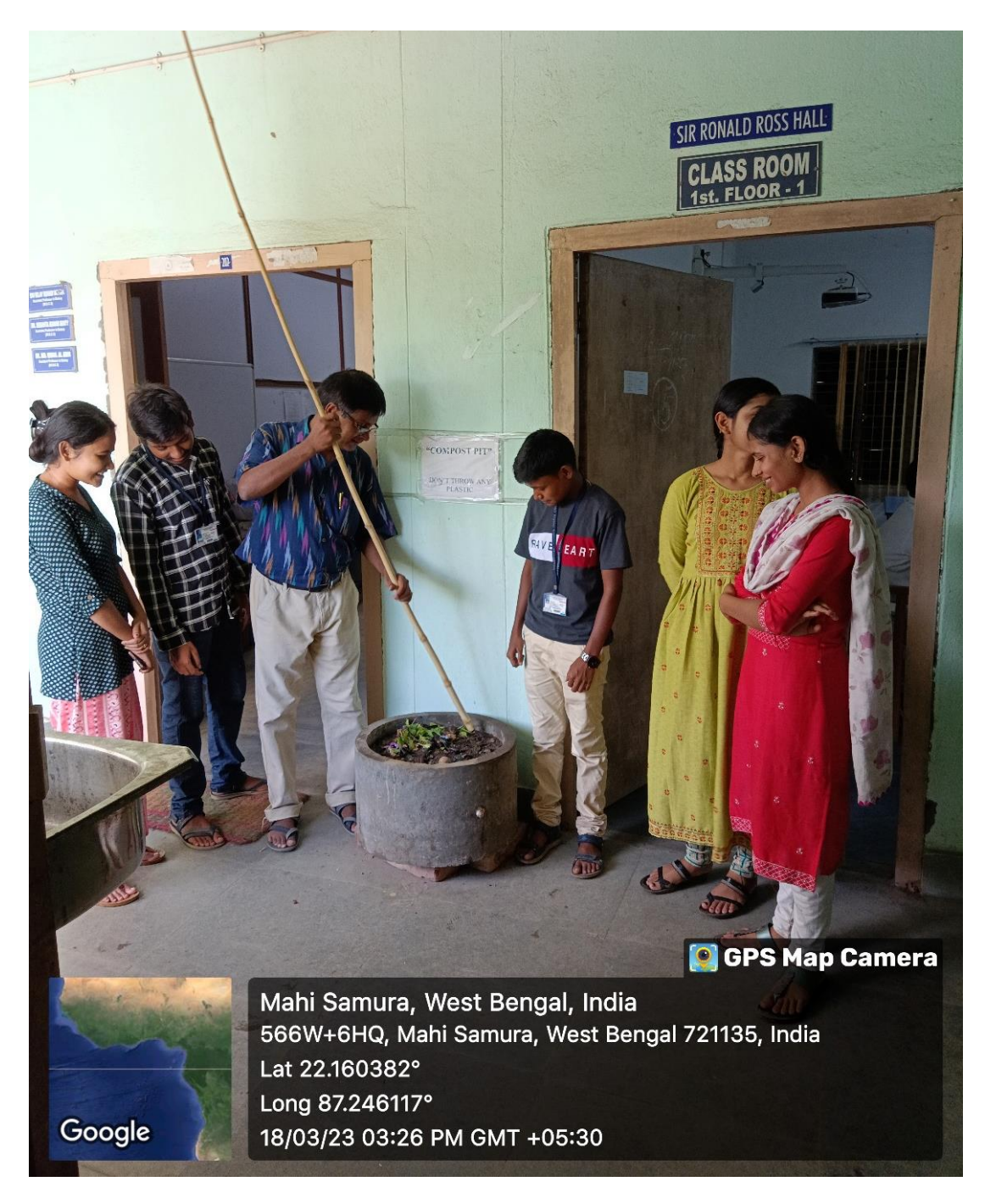
Figure 3: Geo-tagged photographs of a construction ring repurposed for demonstration of vermicomposting technique for processing biodegradable wastes by the Department of Botany, GGDC, Keshiary