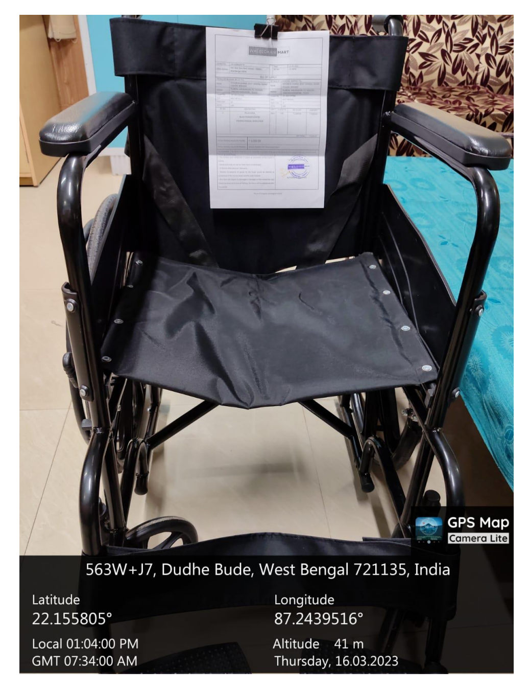
Figure 9: Geo-tagged photographs of wheel chair to assist disabled stakeholders of Government General Degree College, Keshiary