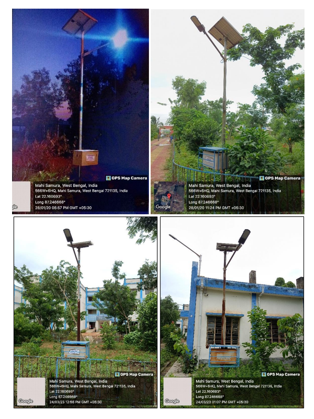
Figure 1: Geo-tagged photographs of solar powered lamp posts installed at Government General Degree College, Keshiary to tap alternate source of energy for illumination of the campus during the dark hours.

A. Sample photographs of alternate sources of energy and energy conservation measures