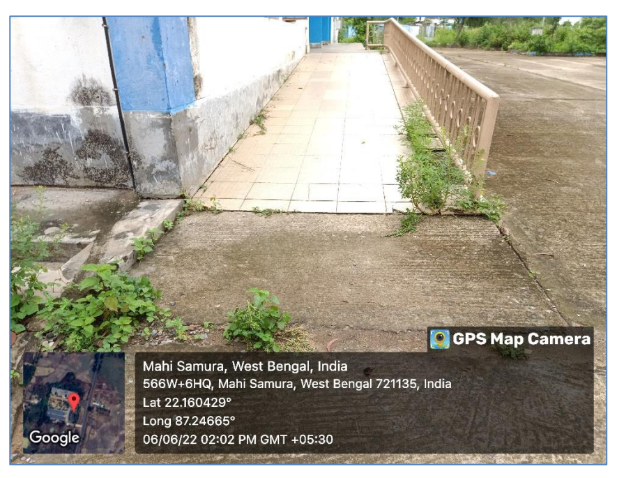
Figure 10: Geo-tagged photographs of ramps (inclined plane) to assist movement of the disabled stakeholders of Government General Degree College, Keshiary