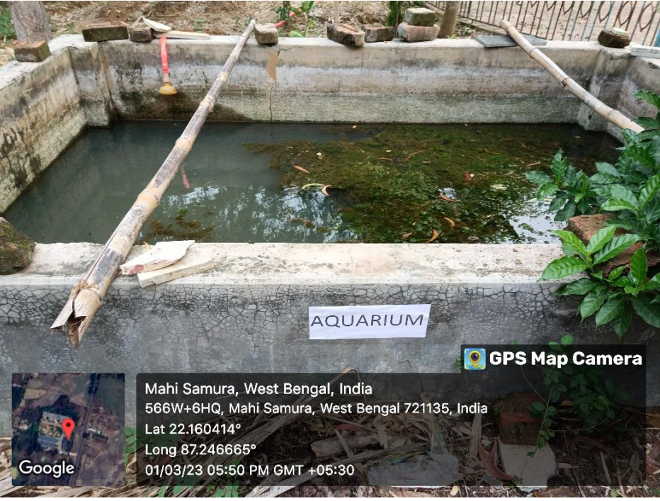
Figure 7: Geo-tagged photographs of open-air rainwater fed and water harvesting tank (construction pit repurposed) installed at Government General Degree College, Keshiary repurposed for aquaculture