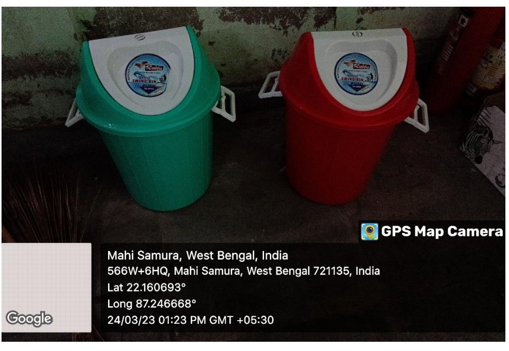
Figure 4: Geo-tagged photographs of collection bins of biodegradable and non-biodegradable wastes at Government General Degree College, Keshiary